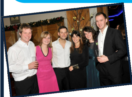
Members meet Matt Baker!

For more info see www.ofyfc.org.uk/county-show